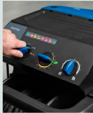
Control panel with safety indications.