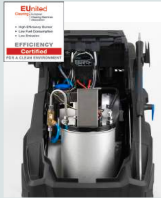
The EcoPower boiler provides high efficiency and low fuel consumption – approved by EUnited.