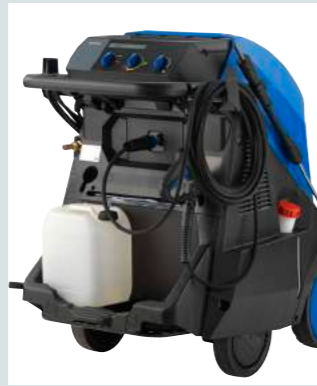
All key functions placed for optimal ease-of-use.