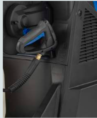
Unique holder prevents spray gun from falling on the ground when the washer is used or moved.

The 4 wheel concept with larger wheel diameter and sweight balance mean that the MH 3M and 4M models provide optimal manoeuvrability over all types of surface – reducing the effort needed by the user to reach their cleaning site.