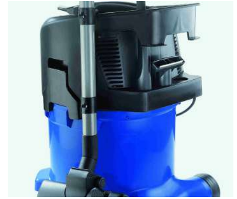
The design lets you have your accessories on hand in a secure way.